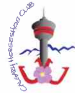
Calgary Horseshoe Club