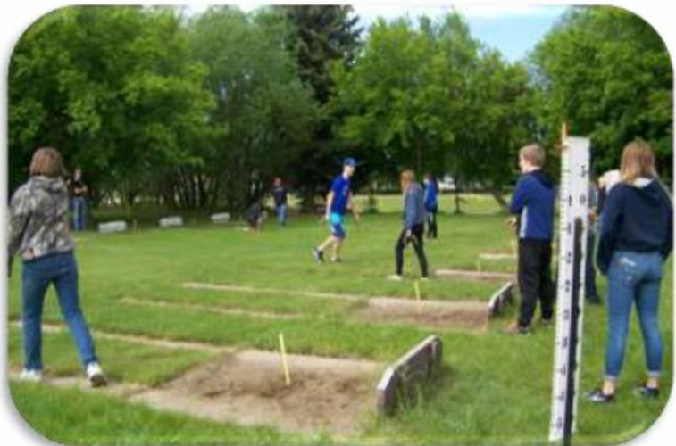
Photo of the school class who helped us, playing games.